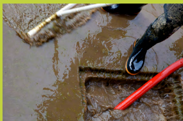
External sewage cleaning