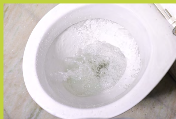
Types of wastewater