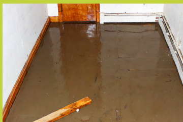
Internal sewage cleaning