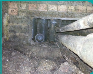
The images above show the chamber beneath the health and fitness club after SafeGroup operatives had removed the sewage