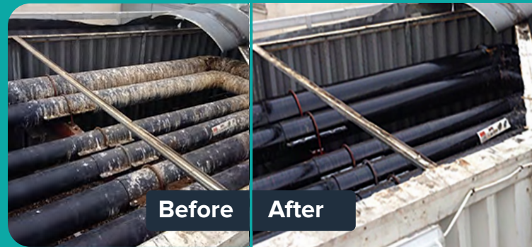
Pigeon guano clean-up - Office block in West London

We found the noxious odours were caused by hundreds of pigeons roosting on heating pipes on the roof. Our bird guano team cleaned the pipes. Then our pest control specialists installed bird proofing to keep out the feathered squatters.